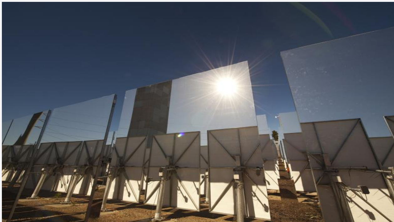
CSIRO's solar technology will be used for a heliostat field in Japan